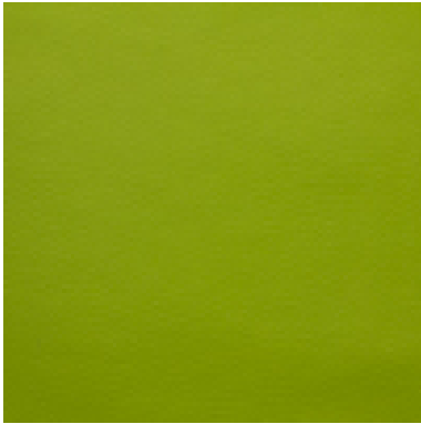
Chrome 6775 *m